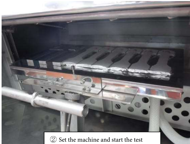
② Set the machine and start the test