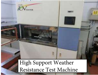
High Support Weather Resistance Test Machine

Test Equipment : High Support Weather Resistance Test Machine (Eye Super UV Tester)